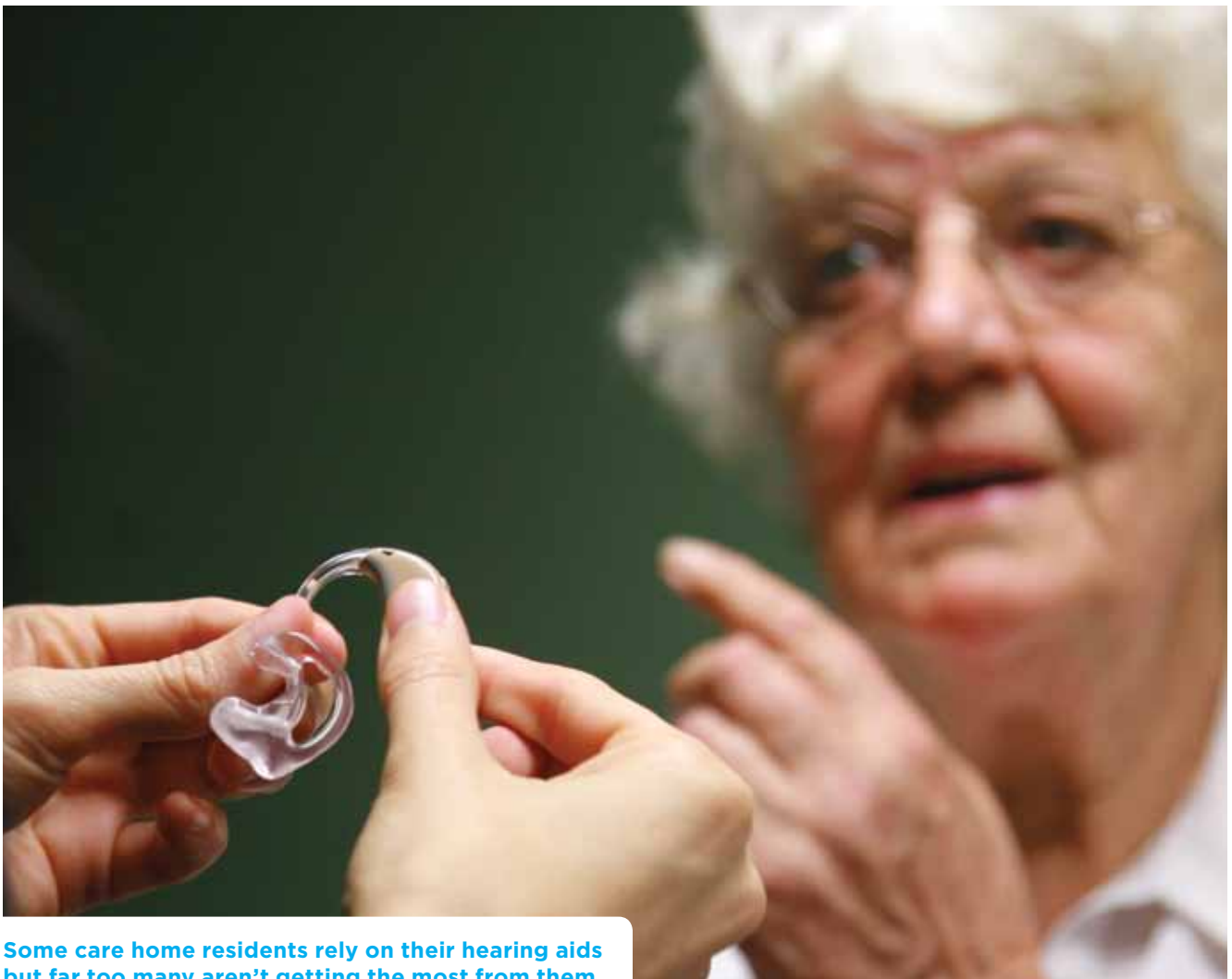
Some care home residents rely on their hearing aids but far too many aren’t getting the most from them.

And even the staff who provided care on a daily basis for residents with hearing loss had only a very limited understanding of the special products available, such as amplified or hearing aid compatible telephones.