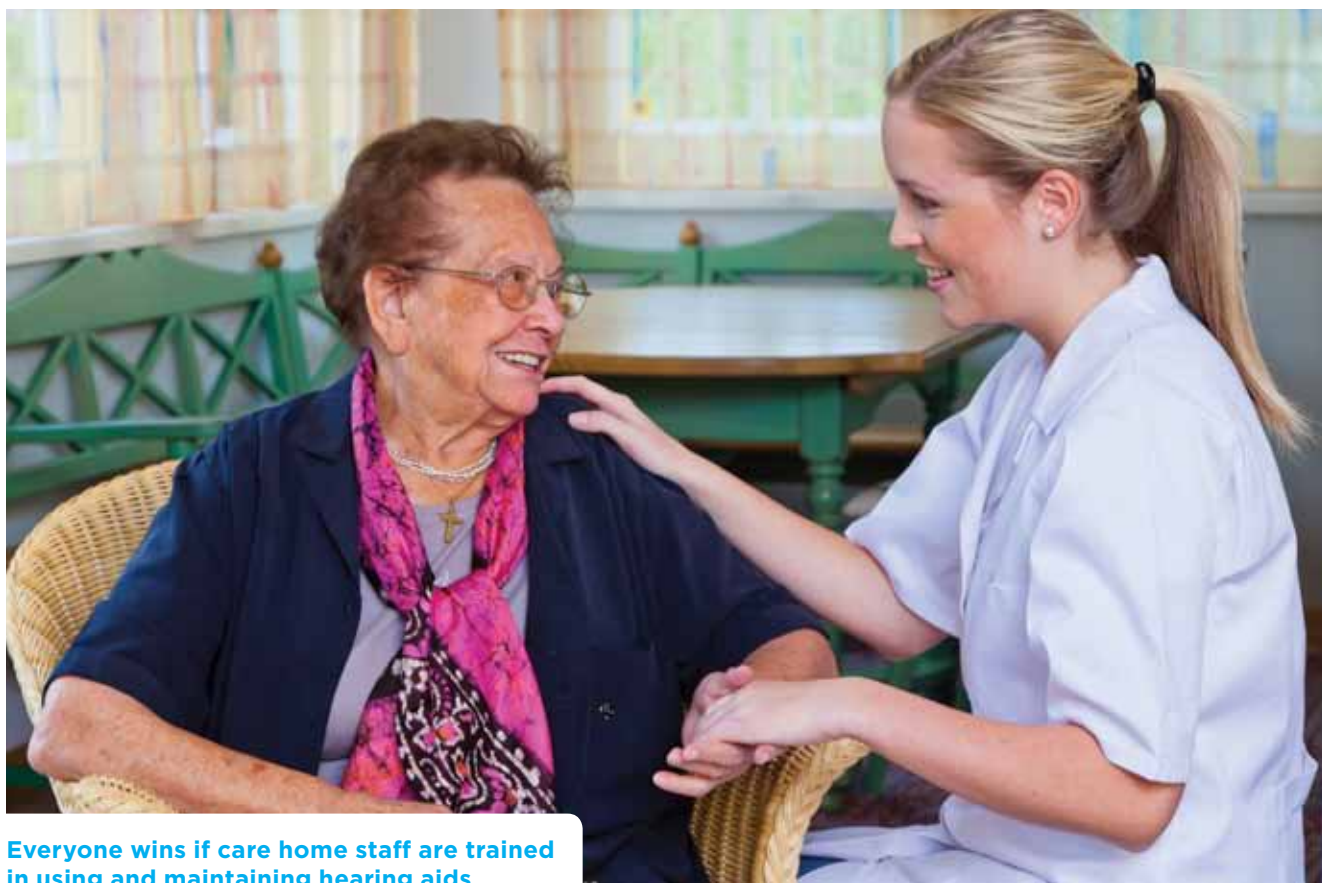
Everyone wins if care home staff are trained in using and maintaining hearing aids.

To read our full report detailing our research findings and incorporating residents' experiences, go to www.actiononhearingloss.org.uk/worldofsilence