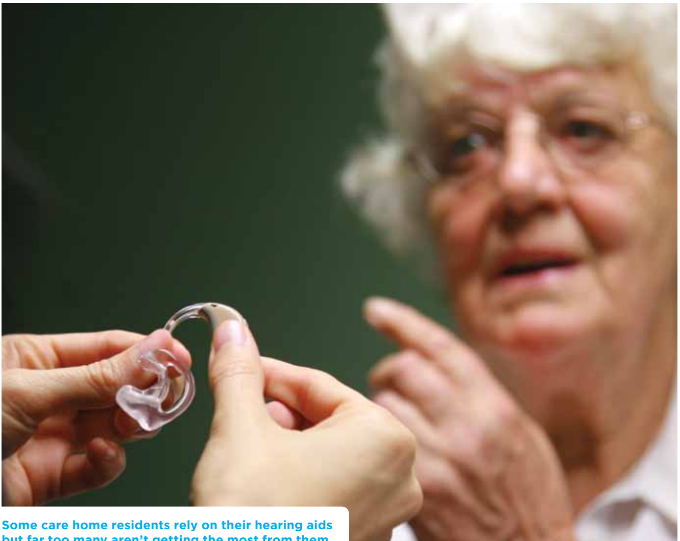
Some care home residents rely on their hearing aids but far too many aren’t getting the most from them.

And even the staff who provided care on a daily basis for residents with hearing loss had only a very limited understanding of the special products available, such as amplified or hearing aid compatible telephones.