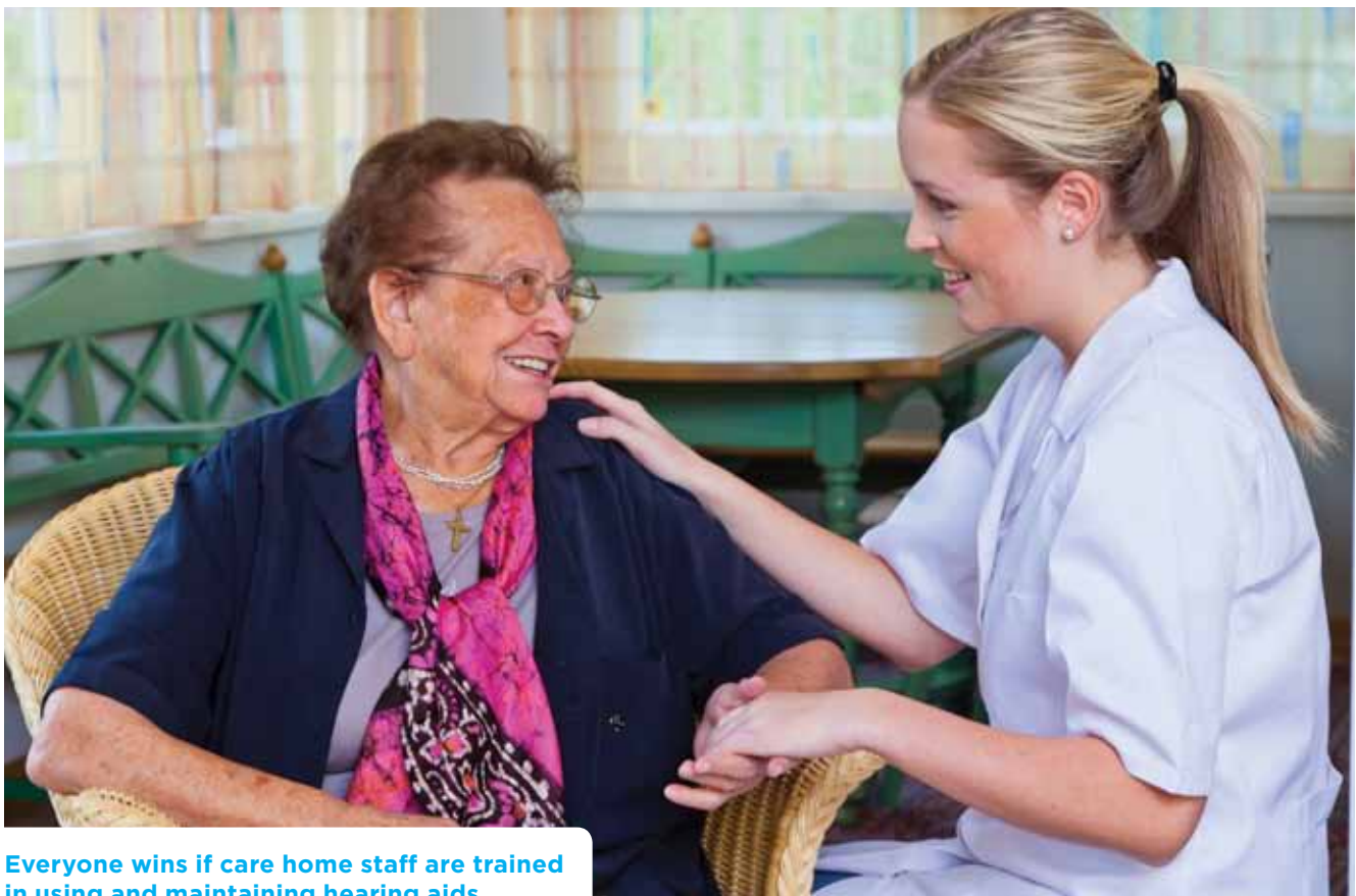
Everyone wins if care home staff are trained in using and maintaining hearing aids.

To read our full report detailing our research findings and incorporating residents' experiences, go to www.actiononhearingloss.org.uk/worldofsilence